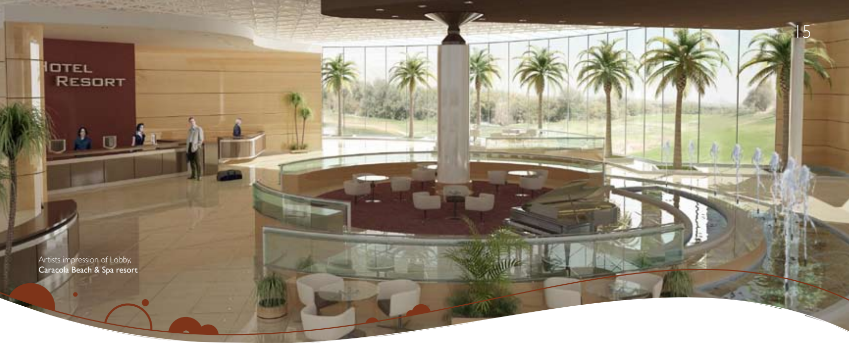
Artists impression of Lobby, Caracola Beach & Spa resort