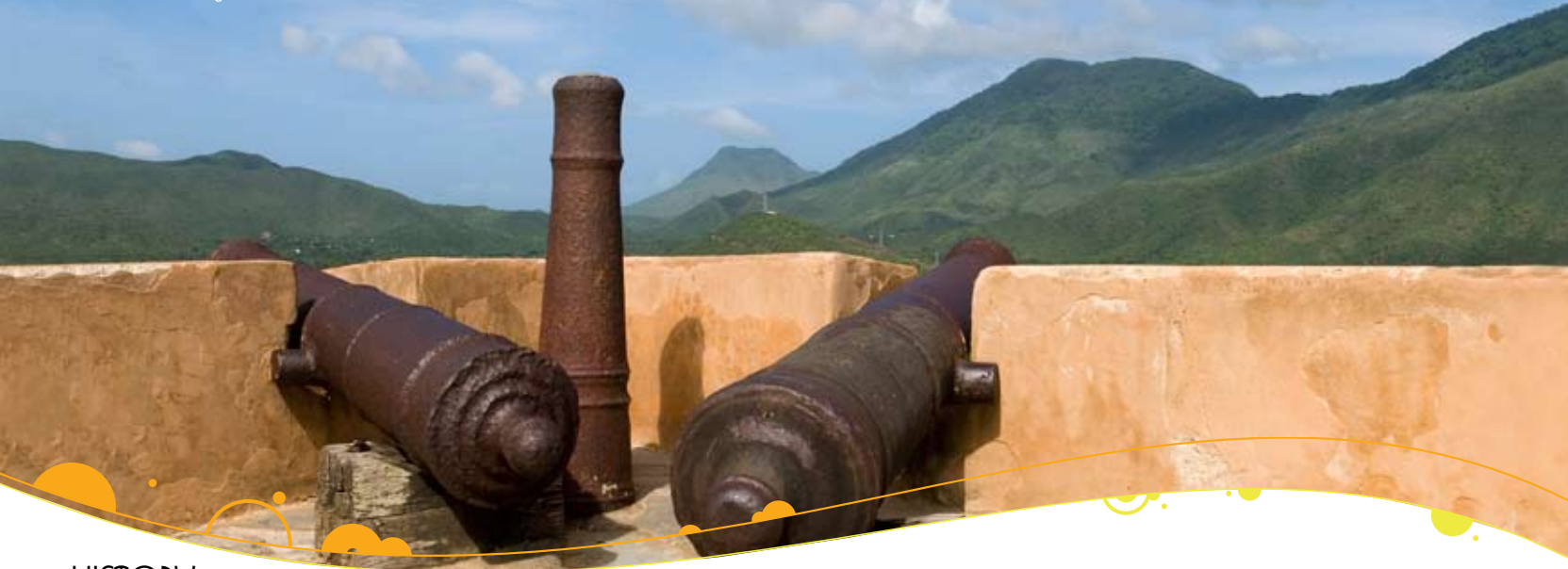
Castillo de Santa Rosa, La Asuncion, Isla Margarita